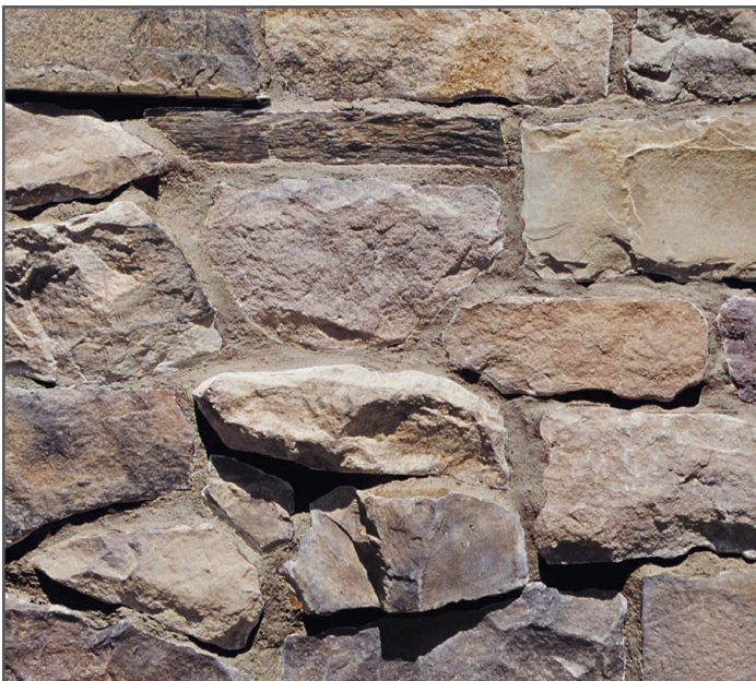
FRENCH COUNTRY VILLA® COLOR: BORDEAUX